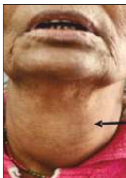
Fig 1: Diffuse swelling over neck, predominantly on left (arrow)

On examination, there was diffuse swelling over neck, anteriorly as well as laterally with slight predominance towards left (Fig 1). There was no stridor or noisy breathing. Her vital were within normal physiological limits, she was maintaining SPO 2 on room air.