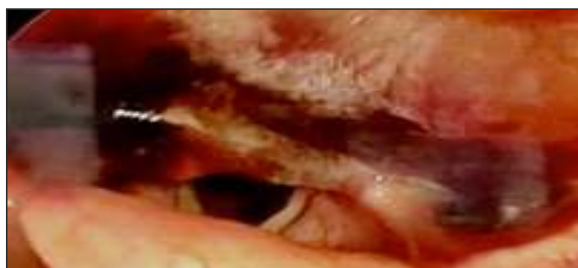
Fig 2: Submucosal ecchymosis and swelling involving posterior pharyngeal wall (arrow)

An urgent fibreoptic laryngoscopy (FOL) revealed ecchymosis and swelling in endolarynx involving posterior pharyngeal wall, arytenoids, however bilateral vocal cords were mobile and glottis chink was adequate (Fig 2). An urgent complete blood counts with INR was done. INR was grossly deranged with a value of 10.1.